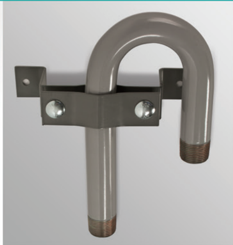
EXTENSION LOOP AND PIPELINE BRACKET