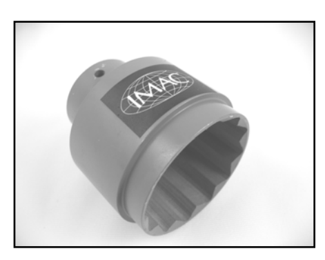
SW202-2 2 <sup>1</sup>/<sub>4</sub>" Hex Machined Socket <sup>3</sup>/<sub>4</sub>" Drive

Specially manufactured with thin wall for B / CL37 / 838 series Actaris Pressure Regulator Orifices