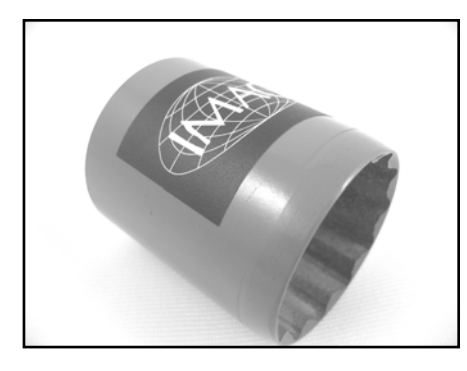
SW202-1 1 <sup>7</sup>/<sub>16</sub>" Hex Machined Socket ½" Drive

Specially manufactured with thin wall for B / CL37 / 838 series Actaris Pressure Regulator Orifices